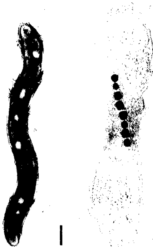
Fig. 1. Electron micrographs of magnetotactic spirillum strain MS-1. Left: cell stained with phosphotungstic acid. Flagella have been displaced from normal positions at ends of cell. Note chain of magnetite particles. Right: cell thin-sectioned to reveal internal location of chain of magnetite particles. Each bar = 0.5 \mu\text{m} .

The magnetic properties of magnetite particles depend on their size and shape. For a particle of roughly cubic shape with side dimension d , there is a range of d over which the particle will be a single