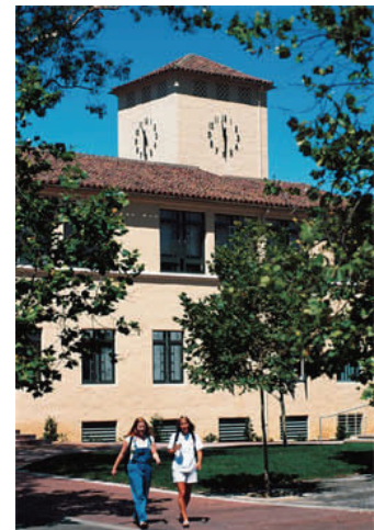
The historic Cal Poly Clocktower at the College of Education

The average load for all students in Fall 2005 was 14.03 with undergraduates carrying a load of 14.20 and post-baccalaureate students carrying a load of 11.04. This total student average load of 14.03 is down from last year's load of 14.20.