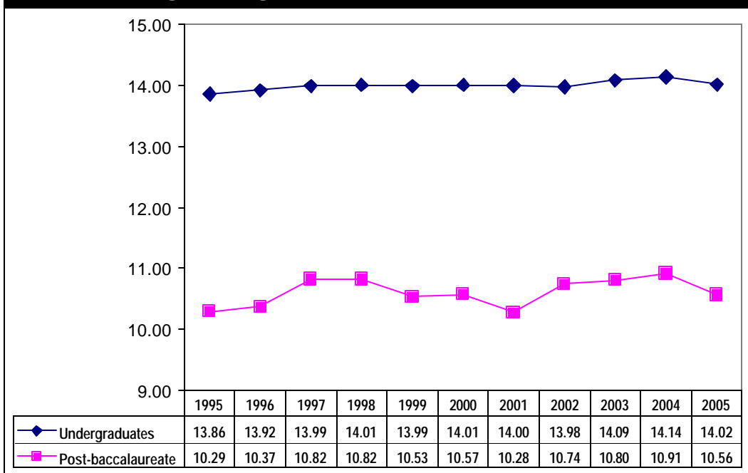
Average Undergraduate and Post-baccalaureate Units

load at 14.20, followed by the College of Architecture and Environmental Design (14.18); the College of Engineering (14.05); the College of Business (13.97); the College of Liberal Arts (13.86); and the College of Science and Mathematics (13.83).